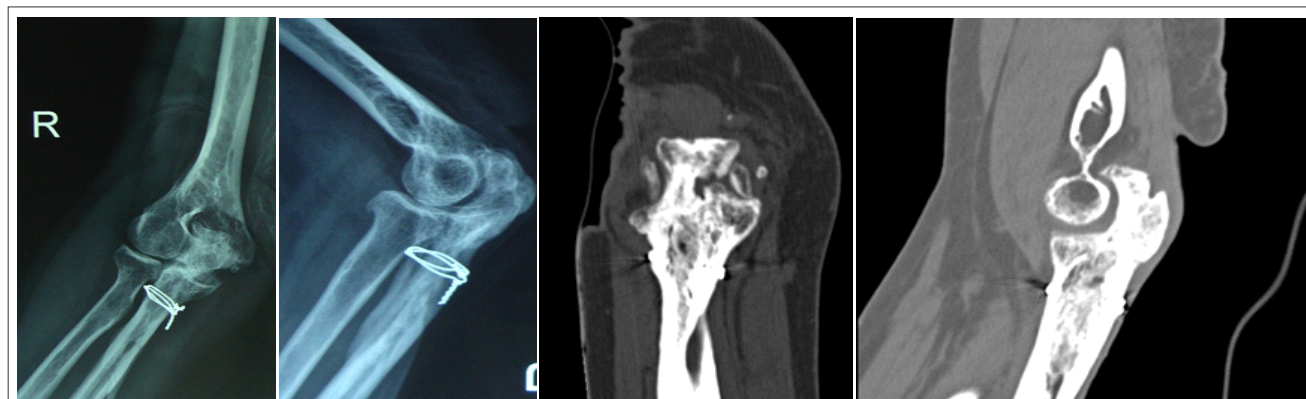
Figure 5: Radiograph (AP, Lateral) & Sagittal CT at three-year follow up

Continuing range of motion while the wound heals is therefore desired in open olecranon injuries. Multiple devices have been described in literature that can be used as a temporary or definitive management to achieve this aim. Tapasvi et al [4] have described a pyramidal configuration external fixator construct for open proximal ulnar fractures. However, small proximal fragments often will not accommodate at least two pins that are required for stability. [4] Moreover, if comminuted (which is often a result of high energy trauma), the proximal fragment will not allow optimal hold for Schanz pins. [4] Kundu et al used a clamp-cum-compressor device in a series of 17 patients with grade I and II open olecranon fractures. [3] Although this device is particularly useful in small wounds; a massive skin loss over olecranon may preclude the use of this clamp as it is applied directly over the olecranon surface through the normal skin. All these devices, being applied near to/ in the wound, will make wound inspection and management difficult