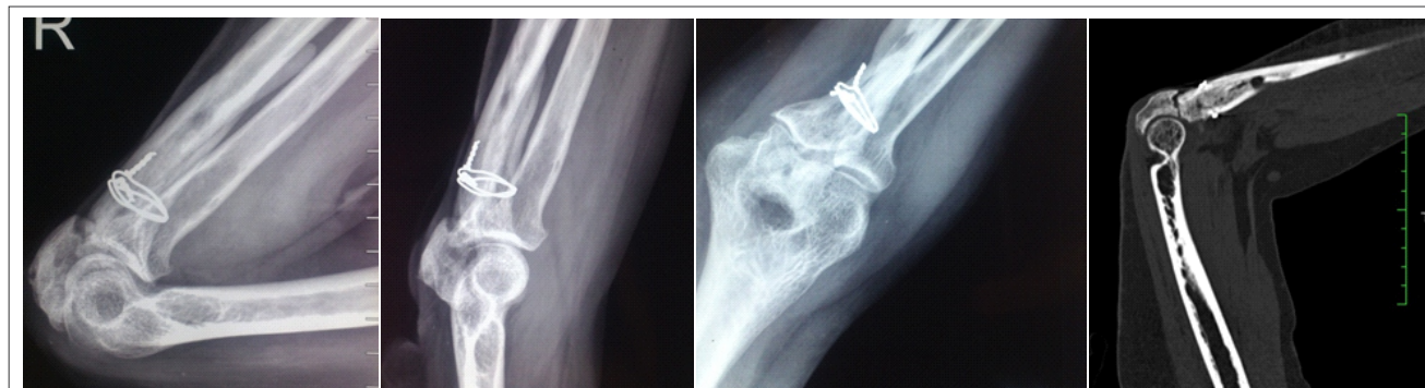
Figure 4: Radiograph (AP, Lateral) & Sagittal CT at one-year follow up

were no signs of infection. On seventh day, the dead skin flap was debrided and daily dressing continued. The wound started granulating and split thickness skin grafting was done on third week. The graft was accepted in most part of the wound except a small area 2 cm 2 distal to the fracture site, which was left for healing by secondary intention. The second olive wire was then removed and active range was encouraged. Wound healed completely over 6 weeks, at which point patient had 90° of flexion. Ulnar nerve had fully recovered by this time, however patient started developing mild symptoms of CRPS, which was managed by physiotherapy and resolved with time. The fixator was removed at 5 months and physiotherapy was continued.