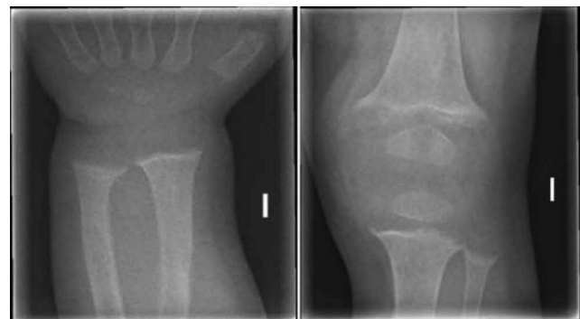
Figure 2 Wrist and knee X-rays at 16 months of age.

Genetic testing for KCNJ11 and ABCC8 genes did not detect any mutation. Responsiveness to diazoxide and glucosuria pointed to HNF4A study, which revealed a heterozygous mutation in exon 2 of the HNF4A gene: p.Arg63Trp,