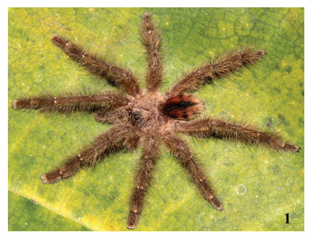
Figure 1. Typhochlaena curumim Bertani, 2012 habitus, male from southern Rio Grande do Norte, Brazil.

Labium : 0.60 long, 1.04 wide, with 50 cuspules spaced by one diameter of each other on the anterior half. Labio-sternal groove shallow and flattened, with two slightly separate, large sigilla.