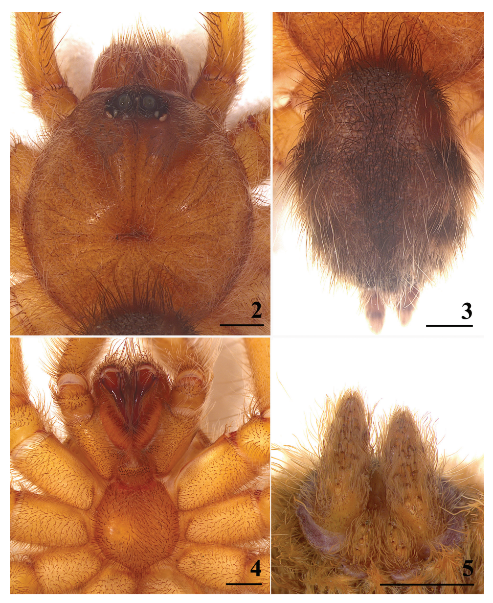
Figures 2–5. Typhochlaena curumim male (MNRJ 6915) 2 carapace, dorsal 3 abdomen, dorsal 4 maxillae, labium, sternum, and coxae 5 spinnerets, ventral. Scale bars: 1 mm.

Palp (Figs 6–10): globous bulb with small subtegulum and slightly developed prominence on tegulum. Embolus: not flattened, lacking keels, 1.62 long in retrolateral view (Fig. 6), about 2.5× length of tegulum. Proximal part not curved in frontal view (Fig. 9); thin distal width, tapering distally; basal, middle and distal width 0.24, 0.08, 0.01, respectively. Tegulum: 0.71 long, 0.4 high in retrolateral view (Fig. 6). Cymbium with two subequal lobes, lacking process on retrolateral lobe.