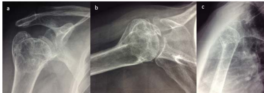
Figure 2. Malunion and tuberosities displacement in a 44 years-old female patient after conservative management of a 4-part valgus impacted fracture treated conservatively in another hospital. The patient has 145 degrees of forward elevation, limited external rotation and Constant score 65.

We performed analytical search of PubMed, Embase, Web of Science, Google Scholar and the Cochrane Library, restricting it to the years 1991-2014 (December). The query was 4-part fractures of proximal humerus or 4-part fractures or valgus impacted fractures or 4-part valgus impacted fractures or fractures with valgus impaction or C1.1, C2.1 proximal humeral fractures. In addition we searched combina-