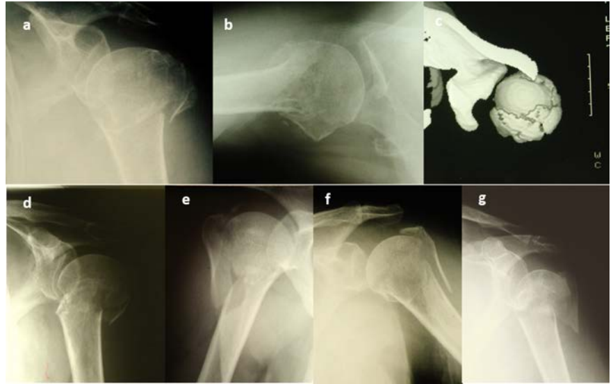
Figure 1. a-c) Typical example of 4-part VI fracture in two radiographic planes (a) anteroposterior and (b) axillary; c) computed tomography scan showing the spread of both tuberosities and the impaction of the humeral head. d-g) Other examples of 4-part valgus impacted fractures with different degrees of humeral head impaction and tuberosities displacement.

To our knowledge, a systematic review of LPFT in the management of 4-part VI fractures of the proximal humerus has not been per-