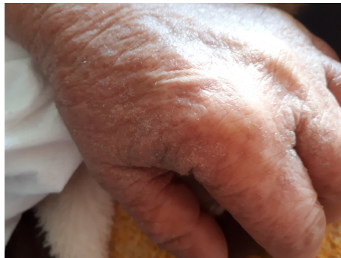
Fig. 1. Scabies crustosa presenting with diffuse cutaneous redness and obtuse thick skin layers

or its damaged and degraded parts (Figs. 3 and 4). The treatment consists in the application of antiscabiotic (3-4), whereas per European guidelines topical Permethrin 5% (first-line treatment) is recommended (7). Sulphur in neutral creams is also suggested in uncomplicated cases, while in crust and resistant forms of scabies the drug of choice is considered ivermectin (7) taken orally. In pyodermized and eczematous extreme cases in order to prevent glomerulonephritic complications, antibiotics are applied according to the scheme and antibiogram (8). Pruritus as