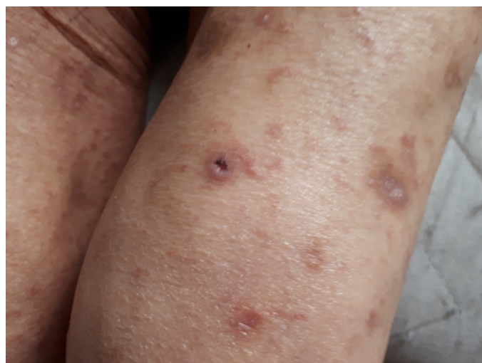
Fig. 2. Scabies crustosa characterised by areas of scaly rash, hyperkeratotic plaques and crusted skin, involving body and arms