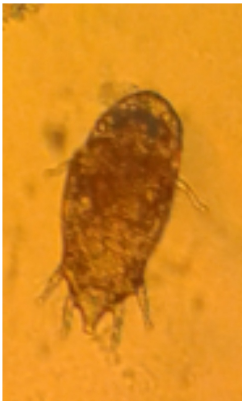
Fig. 3. Sarcoptes scabiei hominis , the human parasitic itch mite (material taken from the patient)