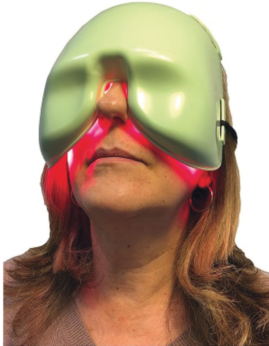
FIGURE 1: LLLT treatment.

lateral canthus while the last one was performed with the device horizontal along the inferior orbital rim. This sequence takes about 5 minutes for both eyes. Then, the LLLT treatment was performed applying a special mask for 15 minutes (Figure 1) (wavelength of 633 \pm 10 nanometers; emission power of 100 mW per \text{cm}^2 ; total fluence in the treated area: 110 Joules per \text{cm}^2 ). No protective eyewear is indicated during this procedure. However, the patients were instructed to keep their eyes closed to maximize the LLLT effect on the upper and lower lids. Every session is designed to both stimulate the function of the Meibomian glands and to soften the meibum. Sessions have been performed weekly for one month.