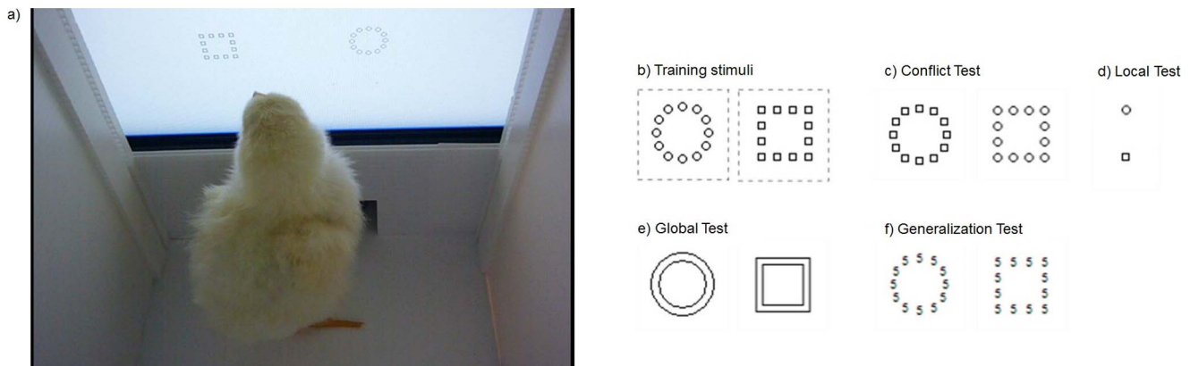
Figure 1. Chick within the apparatus and hierarchical stimuli. A picture of a chick during the training phase in front of the screen while choosing between the two hierarchical stimuli (a). Stimuli used during training (b). Circular configuration of 12 identical circles (left panel) and square configuration of 12 identical squares (right panel) used during training. The dotted lines show the bitmap area for all the stimuli and here shown for the training stimuli for representative purposes only. Stimuli used at Conflict test (c) - the local elements composing the training stimuli are swapped between configurations; Local test (d) - two single local elements of those composing the training stimuli; Global test (e) - two frames covering the global shape of the training stimuli; Generalization test (f) - the local elements composing the training stimuli are replaced with a series of local elements of a new type, a character S. doi:10.1371/journal.pone.0084435.g001