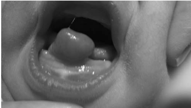
Figure 1 Appearance of a mass protruding from the mouth

rounded, with nuclei ranging from small and dark to large with some vesicular chromatin. No notable nuclear atypia was observed. Immunostaining (Biotin-Streptavidin detection system, Ventana Benchmark XT) with S-100 (Scytek, Clone: 4C4.9) did not show any positivity, and CD34 (Scytek, Clone: QBEND/10) staining emphasized a prominent vascularity. These findings were interpreted as being sufficient to diagnose 'granular cell tumour'.