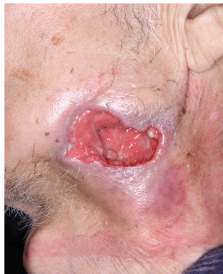
Figure 1. Observation revealed a cutaneous ulcerated lesion in left submandibular region.

Odontogenic fistula is defined as pathologic communication between skin and oral cavity [1]. It is rare and often