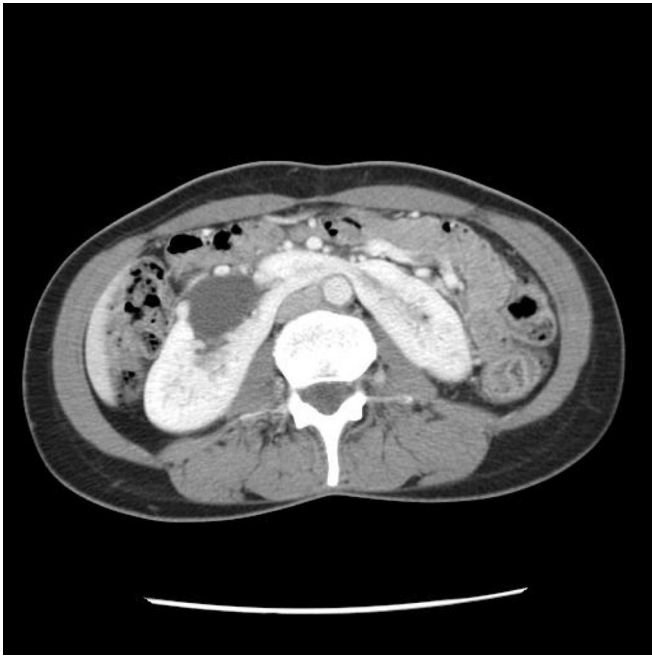
Figure 1. CT scan of horseshoe kidney and right ureteropelvic junction obstruction (Case 1).