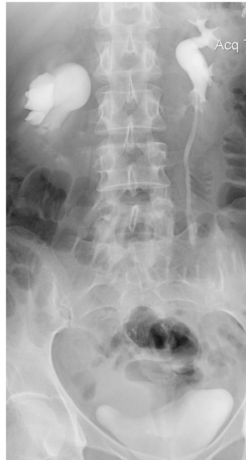
Figure 2. IVP of right ureteropelvic junction obstruction in horseshoe kidney. No contrast excretion is visualized beyond the right UPJ (Case 1).

The colon is reflected medially and Gerota's fascia opened longitudinally to expose the renal pelvis and ureter in the