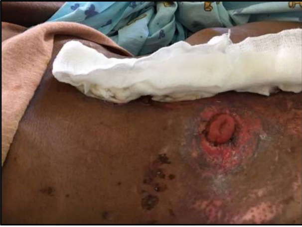
Figure 4: Improved peristomal wound; on postoperative day 7 the external stoma diversion was removed; significant improvement of peristomal skin maceration is noted.

anesthesia and does not require an anesthesia provider. It can be placed by a surgeon, general practitioner or surgical non-physician clinician. For this patient at postprocedure day 7, the proximal aspect of the condom becomes torn at the suture site, necessitating removal. Though at this stage of healing, the surrounding skin was improved and could accommodate traditional stoma bags, the patient and his family requested that the local general practitioner remove and replace the external stoma diversion using the same technique (Fig. 4).