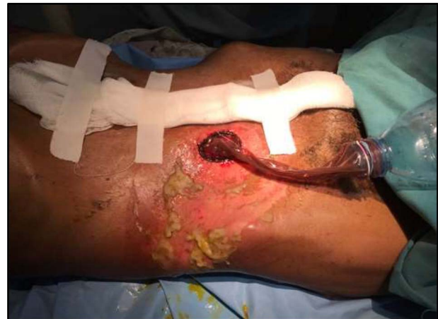
Figure 3: External stoma diversion; this image shows the external stoma diversion as applied in the patient setting.