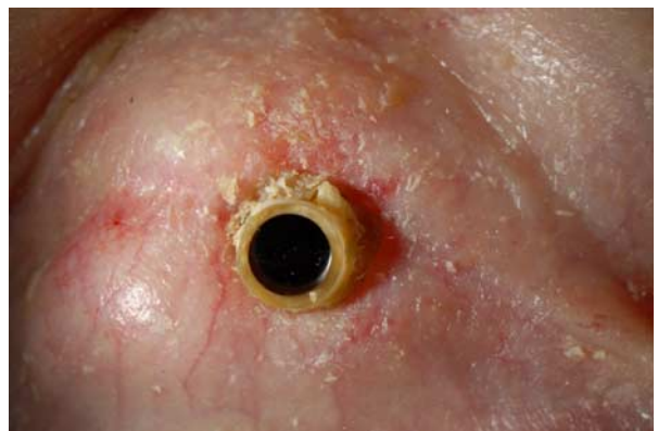
FIGURE 1. External photo of the right eye after initial Boston keratoprosthesis type II surgery.

The surgery was performed under general anesthesia. After the upper lid was injected with 1% lidocaine with epinephrine, 2 skin incisions were made through the upper lid in the superotemporal and superonasal regions 10 mm posterior from the center of the keratoprosthesis optic. The skin was dissected