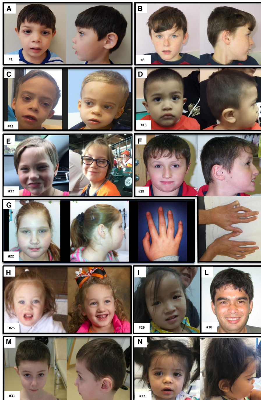
Fig. 2 Twelve individuals with TCF20-associated neurodevelopmental disorder (TAND). Facial features are variable from normal or mildly dysmorphic: subject #8 ( b ), subject #25 ( h ), subject #29 ( i ), and subject #31 ( m ) to dysmorphic: macrocephaly in subjects #11 ( c ) and #30 (picture taken at 22 years old) ( l ); brachycephaly in subject #19 ( f ); midface hypoplasia in subject #17 and #32 ( e, n ); long eyelashes, thick lips, and occipital groove in subject #32 ( n ); upper lip abnormality including tented or thin upper lip in subjects #1, #11, #13, and #17 ( a, c, d, e ); coarse facies in subjects #1 and #11 ( a, c ); long face, full cheeks, deep-set eyes, and prominent lower lip in subject #22 ( g ). Digital anomalies include contracture of the fifth finger in subject #19 ( f ) and slender fingers in subject #22 ( g )

uncharacterized neurodevelopmental disorder [16] have been included in this study after obtaining more detailed clinical information.