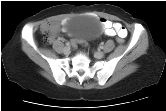
Figure 1 Computed tomography scan showing a mass in the right iliac fossa region.

resonance imaging confirmed the presence of the mass in the right iliac fossa. It was separate from the caecum and lying inferior to it. The differential diagnosis was an inflammatory mass or a pedunculated lesion from the small bowel such as a pedunculated tumour or even a Meckel's diverticulum. Both ovaries were normal. Operative findings were that of a retroperitoneal mass. Excision of the mass was done with repair of the hernia.