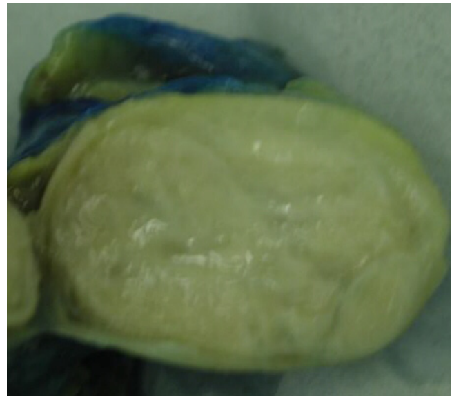
Figure 2 Macroscopic appearance of the tumour showing lobules of fatty tissue with bands and nodules of firm white tissue.

Myolipoma is a rare benign neoplasm, occurring most frequently in adults in the deep soft tissue of the abdomen or retroperitoneum. It is a benign tumour composed of variable amounts of benign smooth muscle fibres and mature adipose tissue with no lipoblasts, floret-like giant cells or zones of atypia.