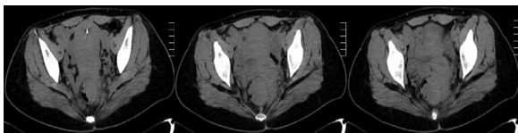
Fig. 1. CT showed the rectal occupying lesions.