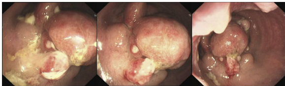
Fig. 2. colonoscopy showed the rectal endometriosis mimicking a rectal carcinoma.

diagnosis of interstitialoma. Supplementary PET-CT examination showed an increase of 18FDG uptake of the rectal mass (Fig. 3), with the standardized uptake value(SUV) as 4.7. PET-CT reported that it was a submucous tumor, with interstitialoma being suspicious. Then another biopsy examination of the rectum mass was done and the diagnosis result was rectal endometriosis supported by the immunohistochemical result.