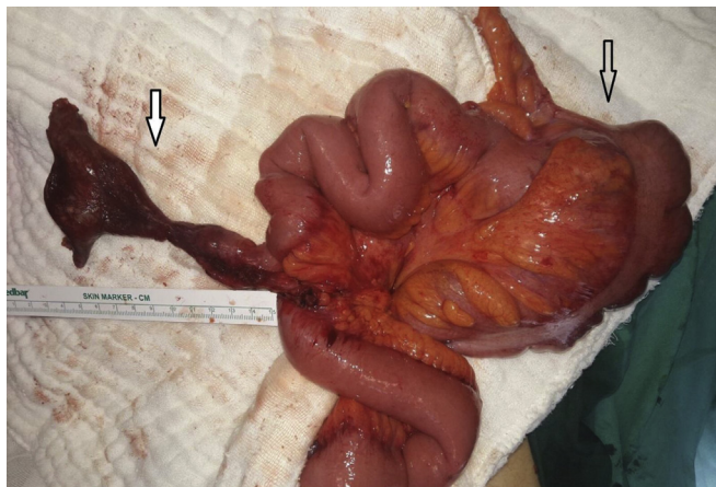
Fig. 3. MD, 12 cm length and located 45 cm proximal to the ileocecal valve.