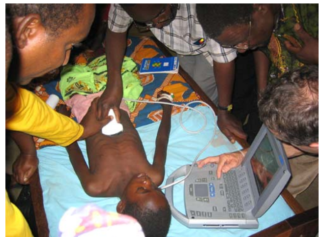
Fig. 1 Hands-on bedside ultrasound training

In cooperation with the leadership of the Lugufu health care facilities we established a logbook to track the use of the ultrasound machine. In particular the log was designed to capture data concerning the indication for the ultrasound exam (as determined by the provider), the exam findings, and basic demographic data about the patient. The logbook required exams to be listed as either “positive” or “negative” and had a free space area used to describe the