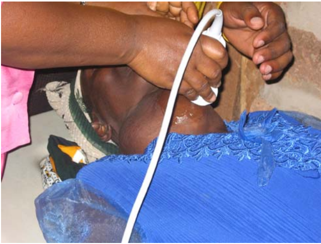
Fig. 2 Examination of a thyroid mass

details of the findings. The free space entries were not standardized for specific findings from specific applications.