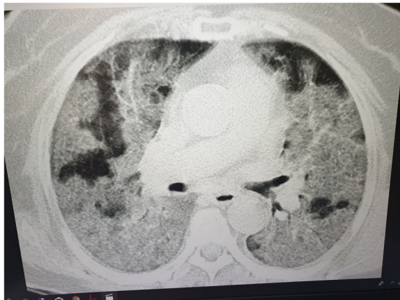
Fig. 1 Typical bilateral peripheral ground-glass opacity (GGO) and crazy paving appearance

At the time of admission, her vital signs showed an oral temperature of 39 °C, respiratory rate (RR) of 44 breaths/min, and pulse rate (PR) of 94 beats/min. She