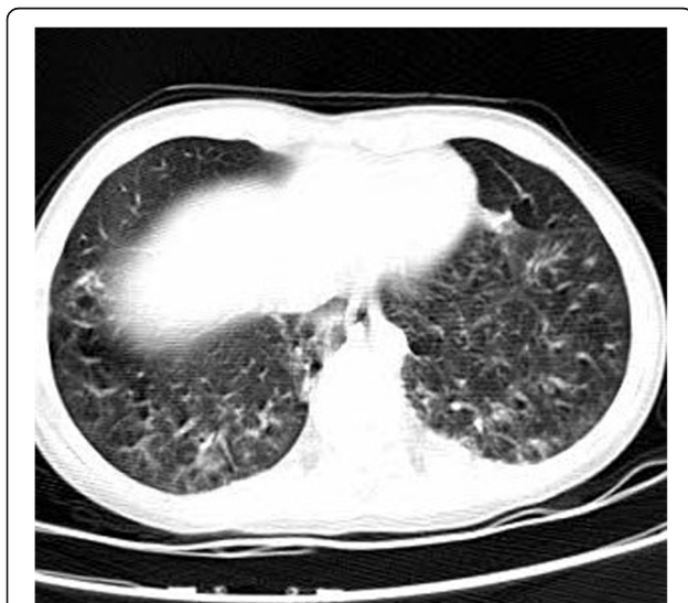
Fig. 3 Interlobular septal thickening and reticular density in both lower lobes and right-sided pleural thickening

Soltani et al. reported that the RSNA criteria cannot be generalized to pediatric patients. They also reported that only 20.7% of confirmed cases with RT-PCR showed a typical appearance of a chest CT scan. Moreover, 79.7% of these cases showed another finding considered inconsistent with CT manifestation of COVID-19. Soltani et al. emphasized that in symptomatic pediatric patients with recent close contact with COVID-19 patients, even in the presence of inconsistent appearance and atypical CT feature, the diagnosis of COVID-19 is highly probable [13].