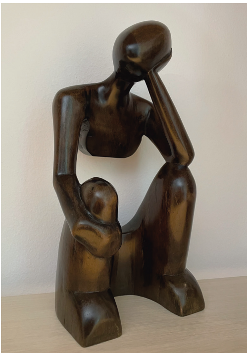
Photo: A village artist's rendition of the thinker.

Public financing is the largest single source of funding in most high-income countries (HICs) and middle-income countries (LICs) and it has the potential to be an effective and efficient actor in the health sector. This is not the case in most low-income countries, especially those with high donor