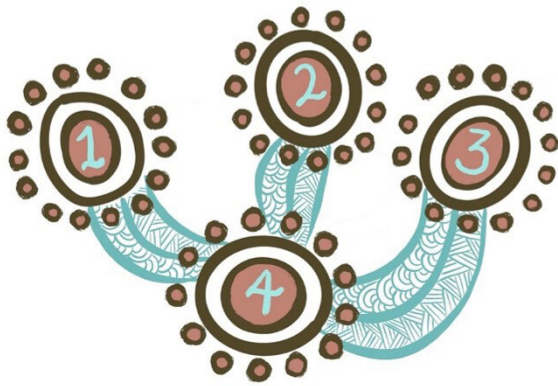
Figure 2 Overview of baarra (steps).

practice meaning ‘to conduct yourself with honour and respect, to do things slowly and thoughtfully’. The lead researcher is a Wiradjuri woman and has developed the conceptual framework for this project building on key guidelines for Aboriginal and Torres Strait Islander health research conduct, depicted in the outside circles. Aboriginal ontology (being), epistemology (knowing) and axiology (doing) are privileged through an Indigenous standpoint and research methodologies 32 33 as depicted in the middle circle. The individual studies of this project are represented in the centre. This project acknowledges the importance of prior ethical guidelines and the substantial work that has contributed to their development and refinement. This project, through Yindymarra , will winhanga-duri-nya (reflect) on how these ethical guidelines have been used in research processes. Through the development of recommendations, more informed research planning can occur, which will maximise efficiency in research consultation and implementation, increasing the potential for positive research outcomes for Aboriginal and Torres Strait Islander people.