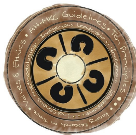
Figure 1 Yindymarra conceptual framework for the proposed research. AH&MRC, Aboriginal Health and Medical Research Council.

This project involves a comprehensive review of Aboriginal and Torres Strait Islander health research, using a conceptual framework Yindymarra , to develop a set of practical recommendations for ethical research adherence (see figure 1 ). Yindymarra is a Wiradjuri cultural