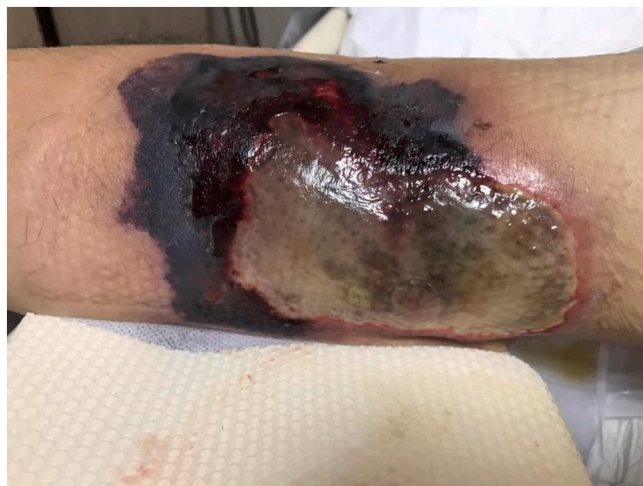
Fig. 1. A large necrotic ulcer I antecubital fossa.

Mucormycosis is an opportunistic, invasive infection caused by fungi belonging to the Mucoromycotina subphylum [1]. This infection is more