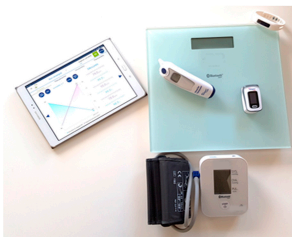
Figure 1. Devices used within the framework of the MyPredi™ platform [3].

Additional information on geriatric risks and disorders was collected on a daily basis by way of questionnaires completed on the tablet. These questionnaires addressed falls, constipation, dehydration, confusion, iatrogenesis, malnutrition, heart failure, hypertension, diabetes, infections, and bedsores. A therapy-related questionnaire was also completed by the caregivers in conjunction with the patient during the patient’s stay. Table 1 illustrates the geriatric risks and disorders that were monitored during the experiment. Tables 2 and 3 illustrate the detailed questionnaires embedded within the MyPredi™ platform and used for monitoring the geriatric risks studied.