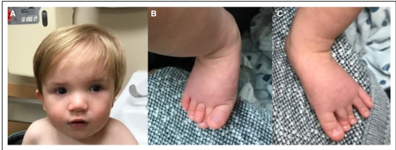
Figure 1. Physical features of an 18-month-old with Alazami syndrome. (A) Telecanthus (inner canthus outside the insertion of the nasal ala) and hypertelorism (pupils are aligned later to the outer corners of the mouth). (B) Overlapping toes on the right foot. (C) third digit brachydactyly on the left foot.