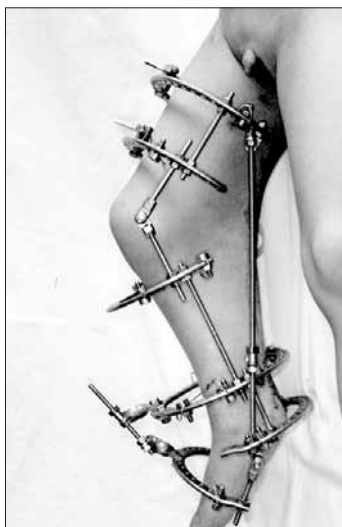
Fig. 2. Photographs showing the application of the Ilizarov external fixator.

PPS is a rare genetic condition that's characterized by popliteal webbing, craniofacial anomalies, genitourinary anomalies and skeletal anomalies. The same as for Van der Woude syndrome, mutation in the interferon regulatory factor 6 gene is presumed to be responsible for the disorder. 6 Bartsocas and Papas 7 postulated that PPS can be inherited in an autosomal dominant and an autosomal recessive manner; autosomal dominant PPS is more common and it shows variable penetrance, but autosomal recessive PPS occurs in patients who are born