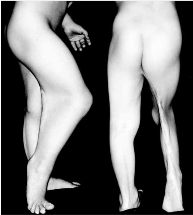
Fig. 1. Photographs showing the flexion contracture and web on the popliteal space of the right knee joint.

to the sciatic nerve. Thereafter, soft tissue lengthening was attempted in another hospital at the age of 5 because the flexion contracture and popliteal pterygium of the right knee relapsed, but the adhesion to the sciatic nerve also caused a failure. On the physical examination, 45° of knee