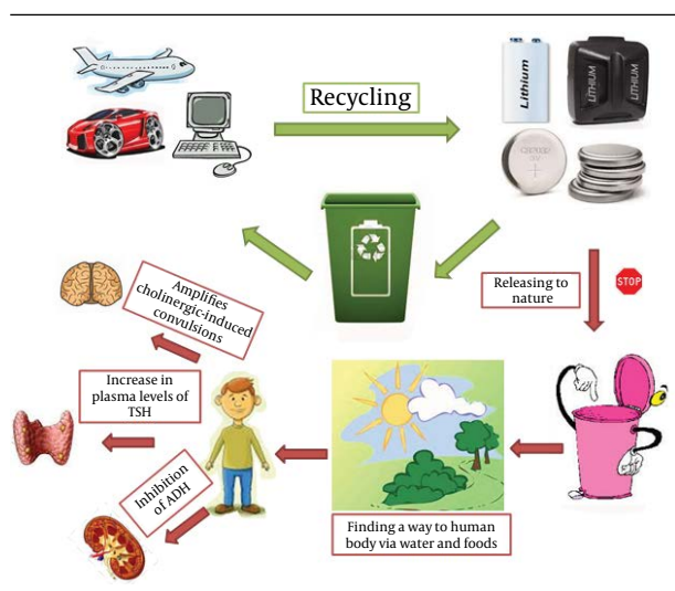
Figure 2. Recycling and/or Releasing the Lithium in the Nature and Accumulation in Human Body to Cause Damages in Diverse Organs

However, literature review gives estimation about toxicity to human (on the basis of per MegaJoule of capacity) as follows: Nickel-metal hydride and sodium-sulfur batteries < Li-ion batteries < nickel-cadmium batteries < lead-acid batteries. However, Li batteries has the lowest performance of greenhouse gases discharge, because up to 12.5 kg of CO 2 equivalent discharged per one kg of Li batteries, while this performance is the best for sodium-sulfur and lead-acid batteries. Meanwhile, production of Li batteries wastes high energy. On the other side, battery disposal can cause adverse impacts on environmental and health safety on both human and wildlife especially where consumers get rid of batteries together with other trashes in the urban solid disposal materials (Figure 2) (3).