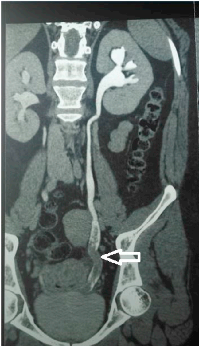
Fig. 1. Contrast-enhanced abdominal computed tomography showed a 5 cm intra-luminal ureteral lesion that is obstructive with homogenous contrast enhancement.