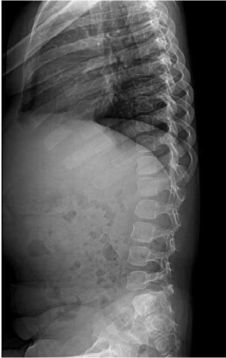
Figure 3. 7- and 11-year-old sisters with mucopolysaccharidosis I, Hurler-Scheie and Scheie syndrome. Radiograph of spine and ribs showed anterior notching in thoraco-lumbar vertebral bodies with mild inferior beaking in L2 vertebra and oar-shaped ribs.

updated the initial guidelines in 2008 on the basis of additional clinical data and therapeutic advances. Based on their recommendations, MPS I has been classified into two