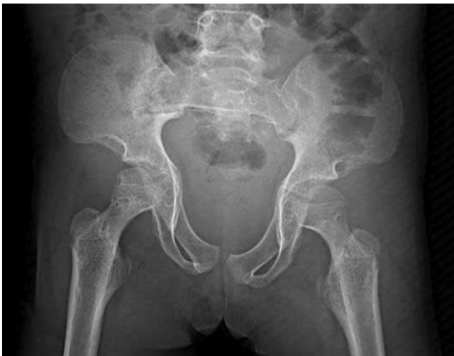
Figure 4. 7- and 11-year-old sisters with mucopolysaccharidosis I, Hurler-Scheie and Scheie syndrome. Radiograph of pelvis showed narrow pelvis with flared iliac wings.

updated the initial guidelines in 2008 on the basis of additional clinical data and therapeutic advances. Based on their recommendations, MPS I has been classified into two