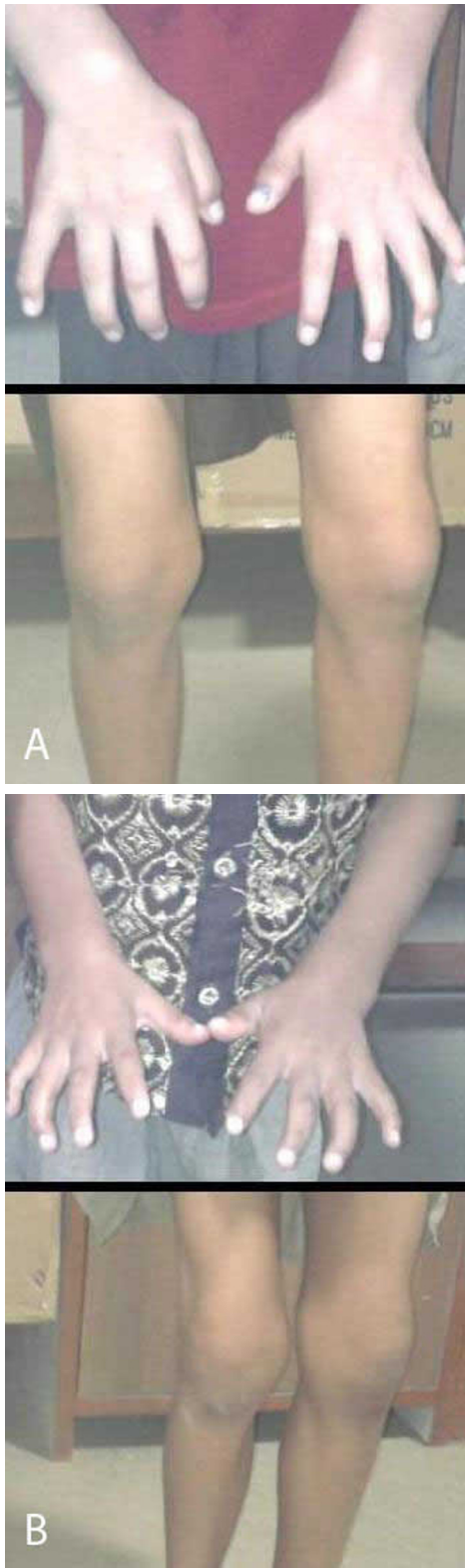
Figure 1. 7- and 11-year-old sisters with mucopolysaccharidosis I, Hurler-Scheie and Scheie syndrome. Picture of hands and knees of both children, showing contracture of joints.