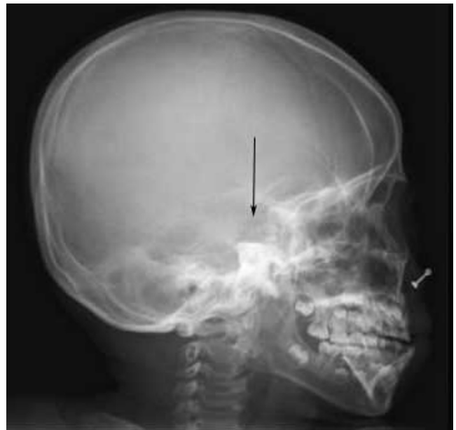
Figure 6. 7- and 11-year-old sisters with mucopolysaccharidosis I, Hurler-Scheie and Scheie syndrome. Skull radiograph with arrow showing J-shaped sella.

Infants with severe MPS I appear normal at birth. Clinical features usually noted within the first two years are hepatosplenomegaly, skeletal deformity, coarse facial features,