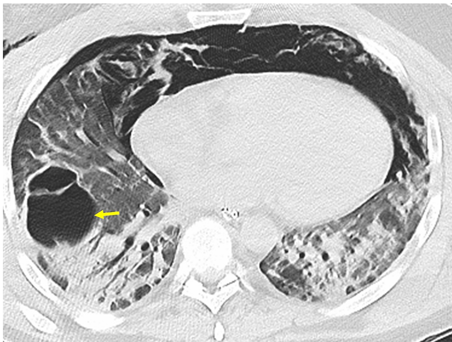
FIGURE 1: CT scan of the chest without contrast

CT scan of the chest without contrast (axial image) shows extensive pneumomediastinum and small right pneumothorax. Pneumatocele (yellow arrow), mild bronchiectasis, ground-glass opacities, and consolidations in bilateral lower lobes can be seen.