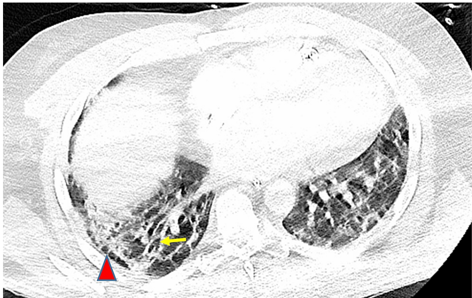
FIGURE 3: CT scan of the chest with contrast (axial image) shows traction bronchiectasis (yellow arrow) and subpleural reticulations (red arrowhead) in the right lung base that is suggestive of progressive fibrosis