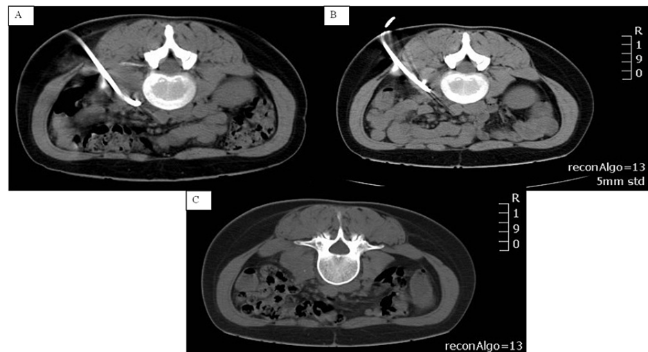
FIGURE 2: Percutaneous drainage of the psoas abscess under radiological guidance

A: CT-guided pigtail catheter insertion for the drainage of the psoas abscess; B: pigtail catheter removal after complete drainage of the purulent fluid; C: the significant resolution of the psoas abscess achieved through percutaneous drainage.