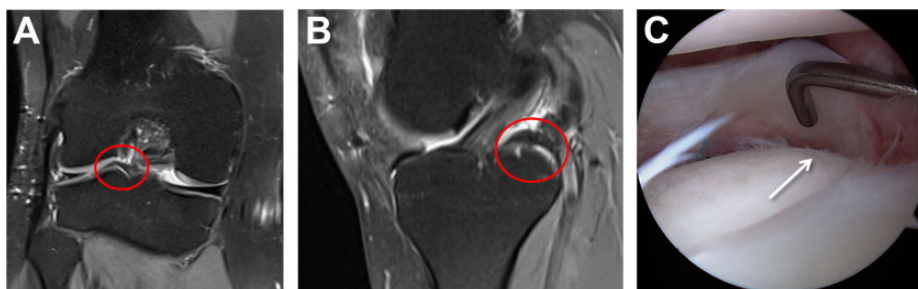
Figure 4. Twenty-seven-year-old woman with a history of multiple knee surgical procedures. T2-weighted magnetic resonance imaging demonstrated an “occult,” or unavoidably missed, tear (circled), even in consensus retrospective review of the (A) coronal and (B) sagittal views. (C) The patient was diagnosed with a lateral meniscus posterior root tear (arrow) during arthroscopic revision lateral meniscus repair.

(Figure 4) in 3 cases. Among the 3 occult LMPRTs, 1 tear was truly not visible, and 2 were obscured by postoperative changes or metal artifact. When these 2 cases were excluded (ie, the 2-slice-touch rule could not be applied), 42 of 43 (98%) cases met the De Smet and Tuite 7 criteria. When the root tears were assessed using the Forkel classification, 2 were graded as type 1, 10 as type 2, and 29 as type 3. There was no significant difference in the likelihood of missing the LMPRT diagnosis between type 2 and type 3 tears (OR, 2.8; 95% CI, 0.5-15.7; P = .28 ). Four cases were unable to be classified: 3 were absent or occult on imaging, and 1 was a complex case with an avulsion fracture.