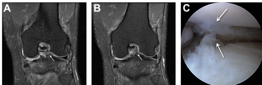
Figure 3. Sequential coronal T2-weighted magnetic resonance images—(A) more posterior and (B) more anterior—of the left knee of a 33-year-old man demonstrate subtle irregularity and intermediate signal within an attenuated posterior root lateral meniscus (arrows). This tear was characterized as “subtly evident” by the reviewers. (C) The same meniscus tear (arrows) on subsequent arthroscopic examination.