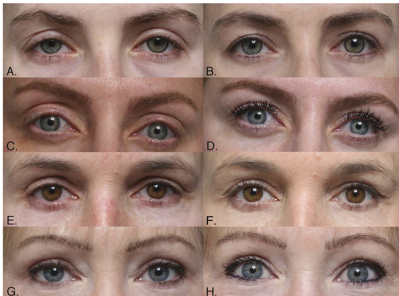
Figure 1 (A) A 31-year-old woman with hollow upper eyelid, high crease, and redundant platform skin after anterior levator ptosis surgery. (B) Same patient 12 months after crease-lowering ptosis surgery and mobilization of orbital fat. (C) A 44-year-old woman with ptosis, eyelash ptosis, indistinct upper eyelid crease, and compensatory brow elevation after multiple ptosis surgeries. (D) Same patient 12 months after crease-lowering ptosis surgery and mobilization of orbital fat into the reconstructed upper eyelid fold. (E) A 39-year-old woman after quadrilateral blepharoplasty with upper eyelid ptosis, eyelash ptosis, and a high crease. (F) Same patient 14 months after crease-lowering ptosis surgery, anchor blepharoplasty, and mobilization of orbital fat into the reconstructed upper eyelid fold. (G) A 46-year-old woman with upper eyelid ptosis, high upper eyelid crease, relative hollowing of the upper eyelid sulcus, and mild compensatory eyebrow elevation after blepharoplasty. Hyaluronic acid fillers are also present in the upper eyelid fold. (H) Same patient 12 months after crease-lowering ptosis surgery, anchor blepharoplasty, mobilization of orbital fat into the reconstructed upper eyelid fold, and removal of the hyaluronic acid filler with subsequent intraoperative injection of hyaluronidase.

septum provided a landmark that could be vertically divided centrally to identify the septal fusion with the levator aponeurosis in all cases (see video ). In the white-line disinsertions, there was generally loose areolar tissue above the level of the tarsus between the posterior surface of the levator aponeurosis and anterior to the superior tarsal (Müller's) muscle, which was dissected as high as Whitnall's ligament as needed to advance the levator aponeurosis.