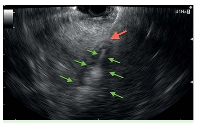
Fig. 2 Still image of initial endoscopic ultrasonography with fine needle infusion (EUS-FNI) with needle tip (red arrow) being withdrawn through tumor while infusing 98% ethanol solution (green arrows).

The patient reported complete resolution of his baseline abdominal pain 2 weeks after discharge, was able to discontinue one of his hypertensive medications, but experienced only minimal improvement in his flushing and diarrhea. Chromogranin A levels fell from a pre-treatment level of 460 to 132 ng/mL and a followup CT scan revealed an interval decrease in tumor size from 9.0× 11.4 cm to 6.7 × 9.8 cm ( ▷ Fig. 3 ).