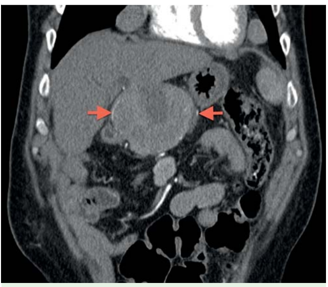
Fig. 3 Coronal abdominal computed tomography (CT) image performed 3 months after second endoscopic ultrasonography with fine needle infusion (EUS-FNI) revealed a 36% reduction in tumor size, now measuring 6.7 × 9.8 cm (red arrows) with area of central necrosis.