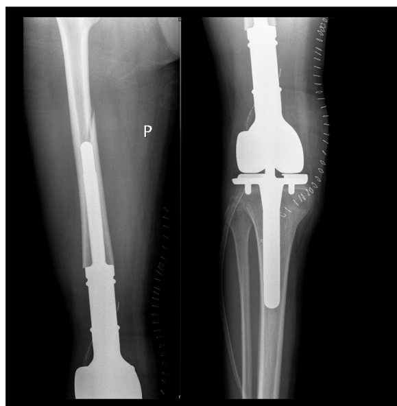
Figure 2. 17-year-old boy with femoral osteosarcoma one year after implantation of endoprosthesis. X-ray: fracture of the femoral stump.