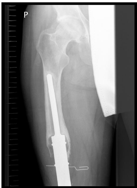
Figure 5. 26-year-old patient with femoral osteosarcoma five years after implantation of endoprosthesis. X-ray: loosening of the prosthesis at the level of the femoral stump.