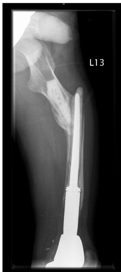
Figure 3. 17-year-old boy with femoral osteosarcoma one month after implantation of endoprosthesis. X-ray: fracture of the femoral stump.

According to the report of the United Nations Scientific Committee on the Effects of Atomic Radiation (UNSCEAR), the widespread belief that children are generally 2–3 times more sensitive to ionizing radiation than adults in the context of malignant tumors formation is not fully correct, since in 15% of cancers (e.g. colon cancer) susceptibility of children is comparable to that of adults. Similarly, in 10%