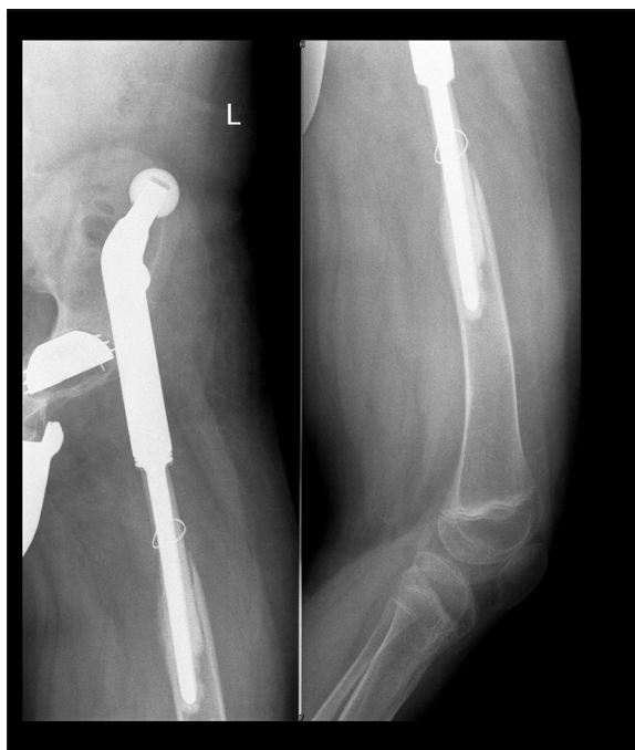
Figure 6. 19-year-old boy with femoral chondrosarcoma one year after implantation of hip endoprosthesis. X-ray: joint dislocation.