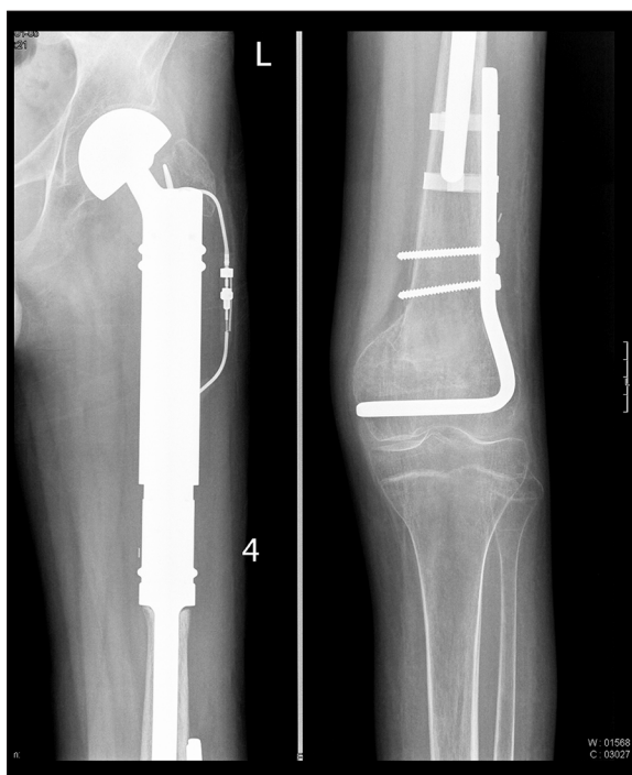
Figure 7. 16-year-old boy with Ewing's sarcoma one year after implantation of hip endoprosthesis. X-ray: osteolytic area in the medial femoral condyle. Disease recurrence was diagnosed.

of cancers (e.g. lung cancer), radiation exposure in children is less significant than in adults [4]. However, it is certain that 25% of cancers in children are associated with a