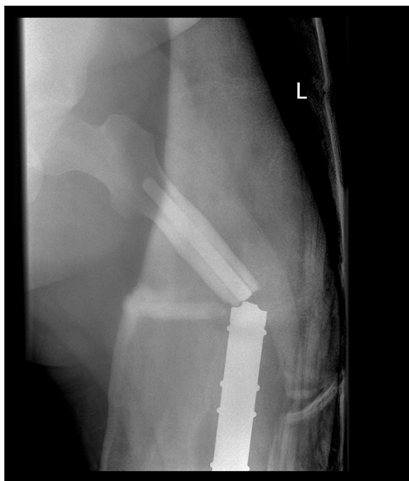
Figure 4. 16-year-old boy with femoral osteosarcoma six years after implantation of endoprosthesis presenting after trauma. X-ray: fracture of the prosthesis.