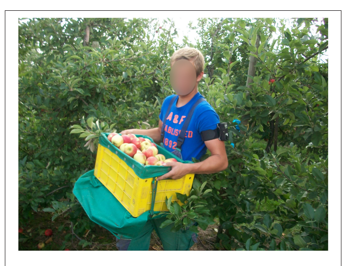
FIGURE 1 | Photograph of a test person at work. The dosimeter was worn by the subjects on the left upper arm as standard (Image/IFA).

Since 2020, the exposure during leisure time activities is currently determined with GENESIS-UV. More than 500 test persons have been active over seven months so far. With the