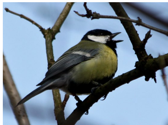
FIGURE 1 A singing male great tit ( Parus major )

We here used the novel automatized wireless Encounternet tracking technology (Mennill et al., 2012; Rutz et al., 2012; Snijders et al., 2014) to experimentally study the spatial behavior of male and female great tits ( Parus major ; Figure 1) in response to the vocal interaction between a neighboring resident and a simulated territory intruder. We simulated territory intrusions by playing the song of an unfamiliar male in the territories of male great tits. Subsequently, we monitored the spatial response of the surrounding male and female conspecifics in relation to specific vocal responses of the territory owner. As a strong vocal response commonly indicates that the resident male is in a good condition (Buchanan, Spencer, Goldsmith, & Catchpole, 2003; Gil & Gahr, 2002), we expected sex-dependent responses with females to be more attracted to stronger vocal responders and males to be more repelled. We investigated three spatial measures in specific: (1) the minimum approach distance of the closest male and female to the intrusion site, (2) the number of male and female connections in the close-range social network of the vocal responder, and (3) the average duration of these connections. We used these different measures to distinguish between eavesdroppers responding solely to the signal, for example, to sample a potential (extra-pair)