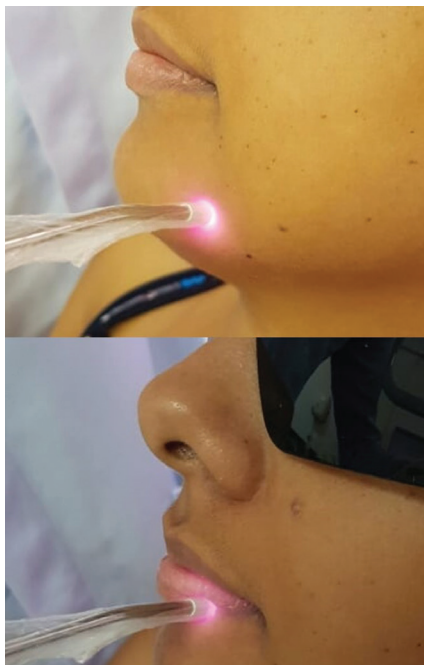
Fig. 3: Infrared laser irradiation in the paresthesia region.

ly 1 cm between points (Fig. 2). All biosafety standards have been properly followed.