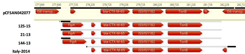
FIGURE 2 | Multiple sequence alignment with pCFSAN042077 from S. Infantis from food from the United States (FSIS150291), of a bla CTX-M-65 cassette on putative ~320 kb plasmids from three S. Infantis strains from food (144-13) and diseased humans (21-13 and 125-15) from Switzerland and one S. Infantis strain from Italy (ERR1014119). The ~5 kb cassette consists of bla CTX-M-65 followed by an IS5/IS1182 family transposase and a gene encoding a TonB-dependent siderophore receptor, and one or two hypothetical genes. The cassette is flanked on either side by the IS6 transposase. The fipA gene is of varied lengths, or absent.

this plasmid in isolates 21-13, 144-13 and 125-15 were detected (data not shown). Specific contigs bearing the bla CTX-M-65 gene and surrounding loci were identified (Figure 2). The ~5 kb cassette consisted of bla CTX-M-65 followed by an IS5/IS1182 family transposase and a gene encoding a TonB-dependent siderophore receptor. The 5'-end is flanked by an IS6 family transposase upstream of the fipA gene, which is truncated in pCFSAN42077. By comparison, fipA is absent in p14026835, a bla CTX-M-65 harboring plasmid from human S. Infantis isolate 14026835 from Italy (ERR1014119), as shown in Figure 2. As predicted, no replicons were detected in the genomes of these three bla CTX-M-65 harboring isolates (Franco et al., 2015).