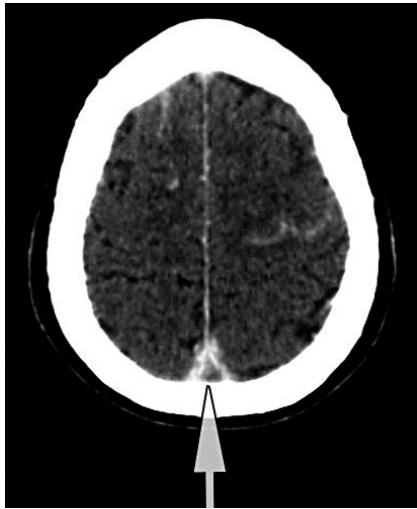
Fig. 3. Cerebral sinus venous thrombosis in the superior sagittal sinus, a subarachnoid hemorrhage in the right frontal region and the left precentral sulcus, with a hemorrhage in the right frontal lobe due to venous congestion.