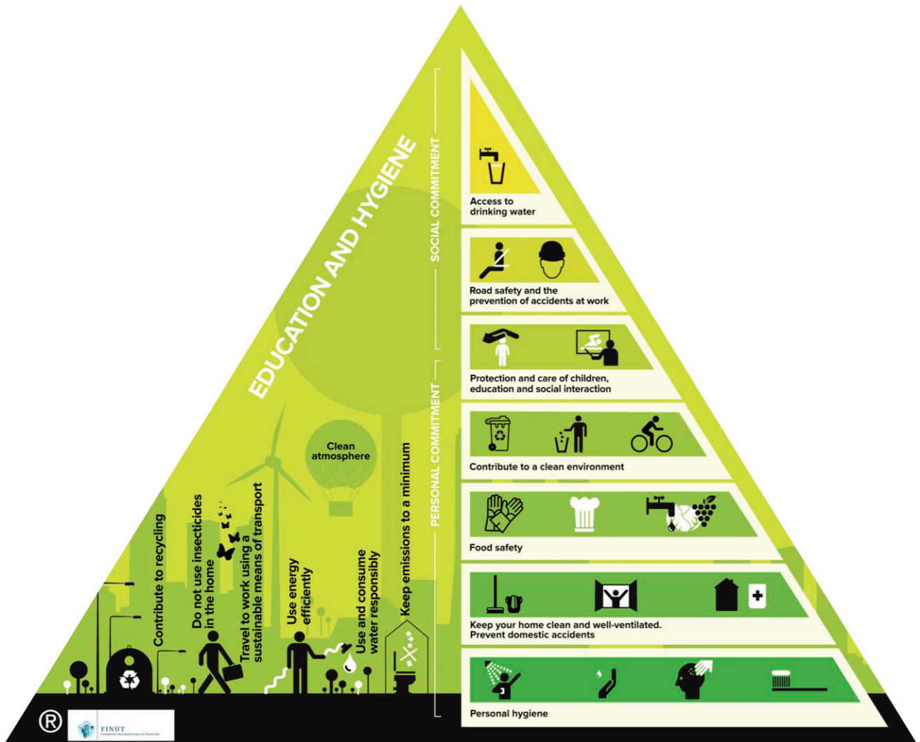
FIGURE 3 Education and hygiene face of the Iberoamerican Nutrition Foundation (FINUT) pyramid of healthy lifestyles. The images of the FINUT pyramid were previously registered as a trademark by the FINUT.

number of PUFAs (22), should be consumed by alternating them in main dishes during the week. Up to 4 portions of poultry and white meats (1 portion = 100–125 g), 4 eggs (1 portion = 60–80 g), 2–3 fish portions (1 portion = 125–150 g), and 2 servings of legumes (1 serving = 60–80 g) per week are recommended. In addition, 2 portions (1 portion = 20–30 g) of nuts should be consumed. At the vertex of the triangle, red meats, high-fat products, sweets, and other sugar-enriched products are grouped in the “consume occasionally” bracket (15,16,25–30).