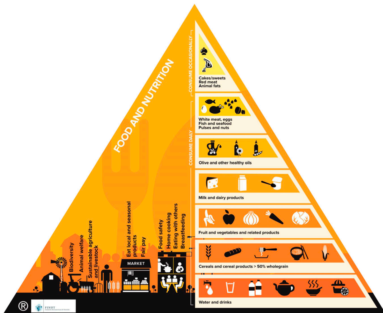
FIGURE 1 Food and nutrition face of the Iberoamerican Nutrition Foundation (FINUT) pyramid of healthy lifestyles. The images of the FINUT pyramid were previously registered as a trademark by the FINUT.

Right half of triangle. In this triangle, guidelines for a varied, balanced, healthy diet, including daily, weekly, and occasional consumption of foods, are provided. The recommended frequency for intakes of the most important groups of foods is illustrated in ascending order from the most to the least frequent. These recommendations are in agreement with those recently proposed in the Mediterranean diet pyramid (18–20). Water and liquid foods are located at the base,