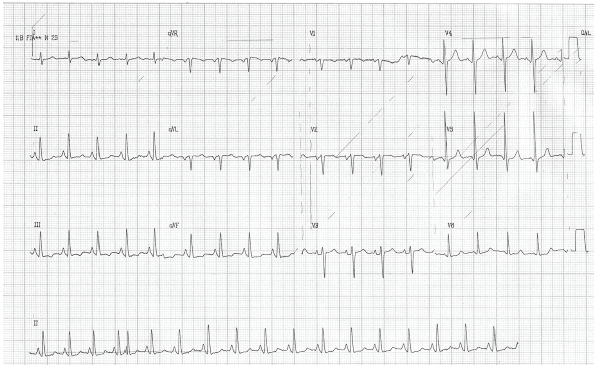
Figure 2 – 12-lead ECG after the pleural space drainage showing normalization of the ST-segment elevation.