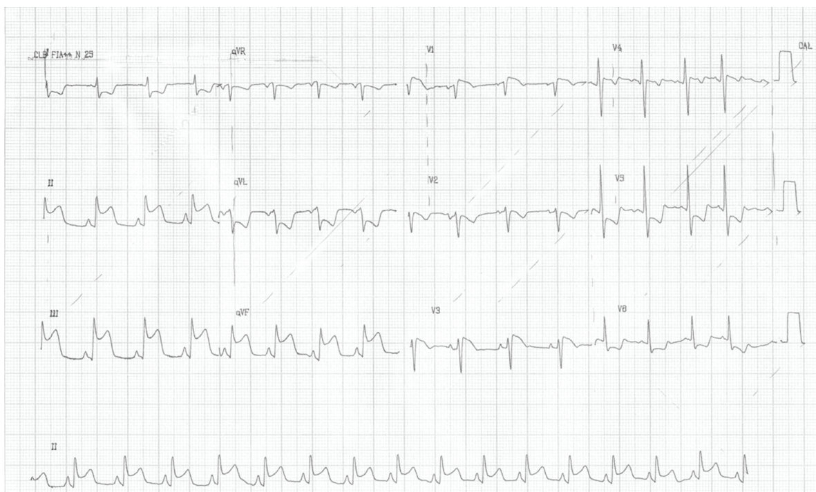
Figure 1 – 12-lead ECG before pleural space drainage, showing sinus rhythm, right axis deviation, small voltage of the R wave in V 1 -V 3 and ST-segment elevation (> 3 mm).

In abnormal situations, ST-segment elevation is one of the electrocardiographic alterations associated with myocardial ischemia coined as a “current of injury.” Moreover, this alteration may also be observed in other clinical entities,