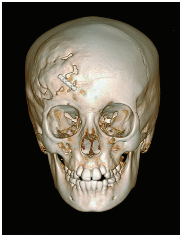
Fig. 4. Postoperative 3D reconstructed CT anterior view showing almost complete ossification of the original and transported segment defects with tiny defects which are a nonlamellar bone that was not apparent in CT.