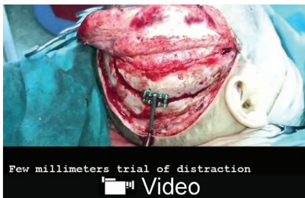
Video Graphic 1. See Video, Supplemental Digital Content 1, which displays intraoperative steps of case 2. This video is available in the Related Videos section of the Full-Text article at PRSGlobalOpen.com or at http://links.lww.com/PRSGO/B43 .

ia. Traditional reconstructive approaches including split calvarial and particulate bone grafts have limitations, as discussed above. 6,7 Split calvarial bone grafts have the advantage of using autologous bone in reconstruction and replacing like-with-like but add morbidity to a donor site and result in 2 reconstructions both with reduced thickness and stability. 8 Also, it is reported that bone grafts over the donor and recipient sites do not heal to the accurate