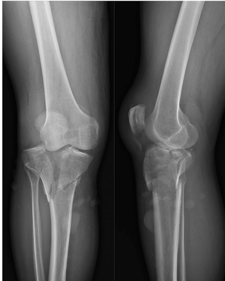
Fig. 2 Radiographs of Schatzker type VI fracture, showing widening of the tibial plateau and comminution of the articular surface. The definition of a Schatzker type VI fracture is bilateral plateau fractures associated with metaphysis fracture

younger patient age was a significant predictor for the development of ACS. In the present research using both univariate and multivariate analysis, we identified that younger patient age had a higher prevalence rate of acute compartment syndrome than the older age, this could be explained by the fact that younger individuals had a relatively increased muscle mass, less compartment size, and thicker and less yielding fascial coverings due to a larger collagen content. This can cause the pressure to develop rapidly within a compartment with a small increase in volume. Furthermore, younger age people having larger muscle bulk within a tight fascia