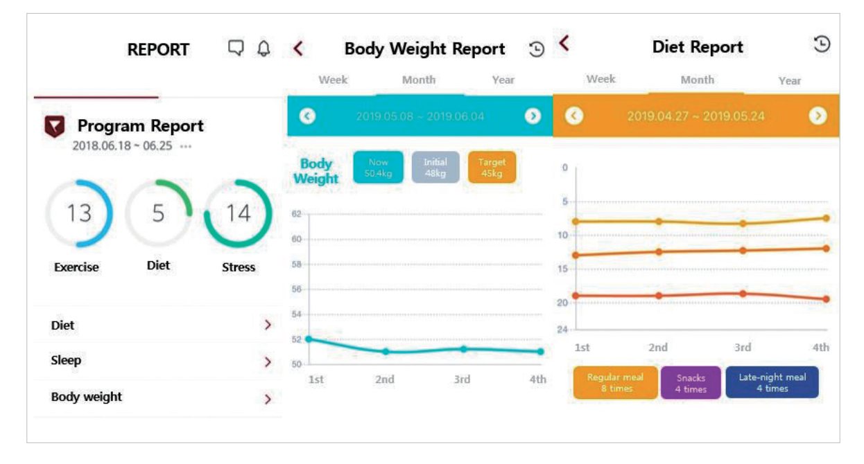
Figure 2. Screenshots of the life log and body weight report.

plans consisted of guided exercise programs as well as low-calorie healthy recipes, which were suggested to participants as shown in Figs. 1 and 2.