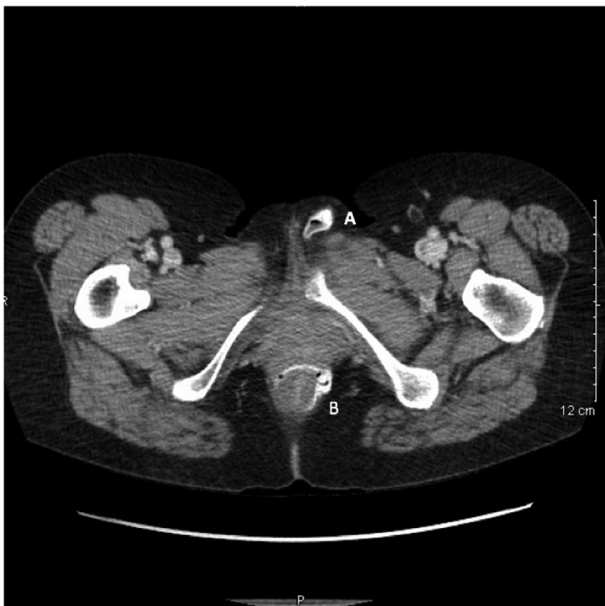
Fig. 4 – Axial CT showing control pump (A) in labia with cuff (B) around anal canal.