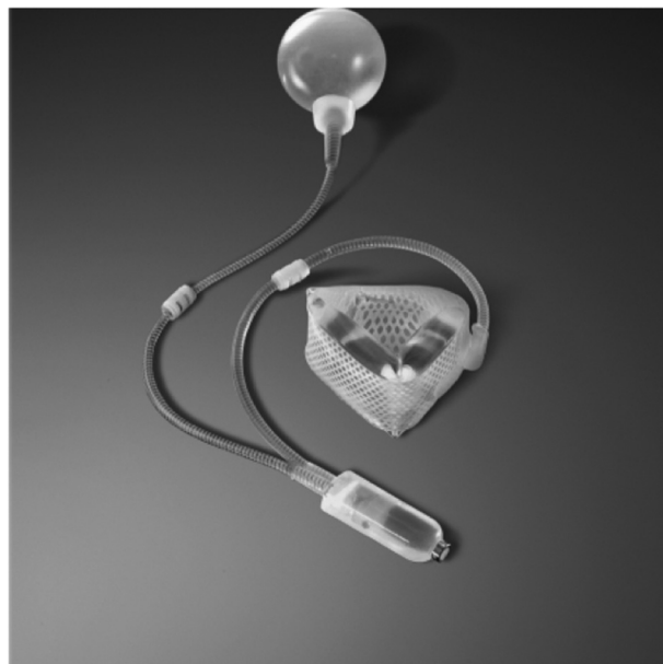
Fig. 1 – An artificial bowel sphincter device, Acticon Neosphincter (courtesy of American Medical Systems, Inc, Minnetonka, MN, www.AmericanMedicalSystems.com ).

While the patient is currently experiencing ABS device malfunction, it should be noted that the device had been