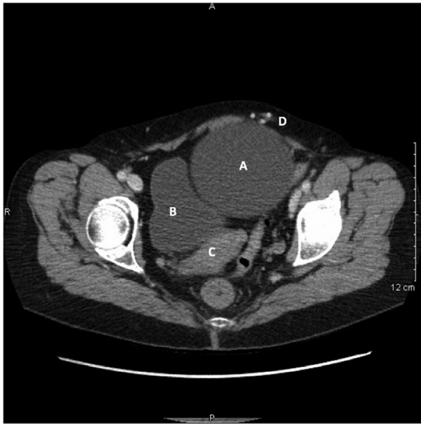
Fig. 3 – Axial CT showing balloon reservoir (A) displacing urinary bladder (B) and uterus (C). Tubing (D) seen in anterior subcutaneous tissue.

functioning for 10 years before failure. Given the risk of early revision and over an 80% risk of revision and 40% risk of explantation after 10 years of having device, this appears to be a good result. The exact life expectancy of the Acticon neosphincter is unknown. One study reported that 8 of 17 (47%) of their patients had their original ABS still in place after 5 years while another study had patients with functioning devices for more than 10 years after implantation [5,6].