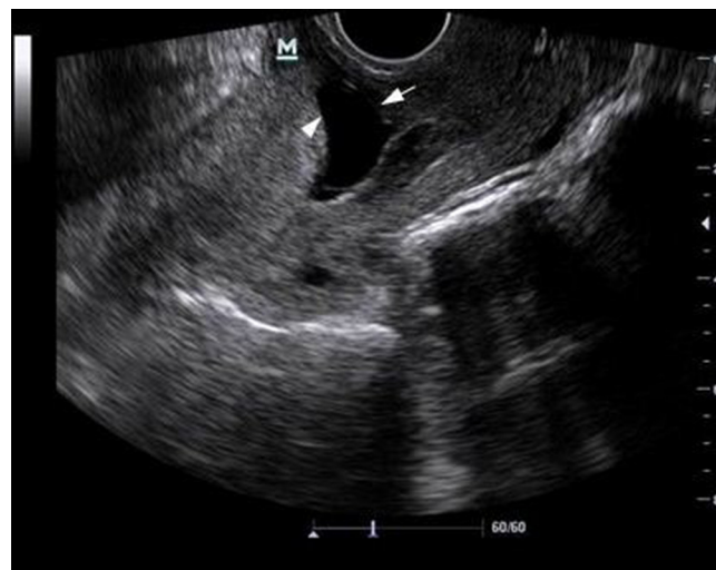
Figure 1. Transvaginal sonography showing an empty uterine cavity with a gestational sac located in the anterior myometrium of the lower uterine segment (solid arrow). The examination also demonstrates a thin anterior myometrium (arrowhead) with no fluid collection in the posterior cul-de-sac.

choriodecidual reaction, and there was also increased blood flow with hypervascularization around the gestational sac (Figure 3). These vascular characteristics, which represent the peculiarity of the described TVS findings, were