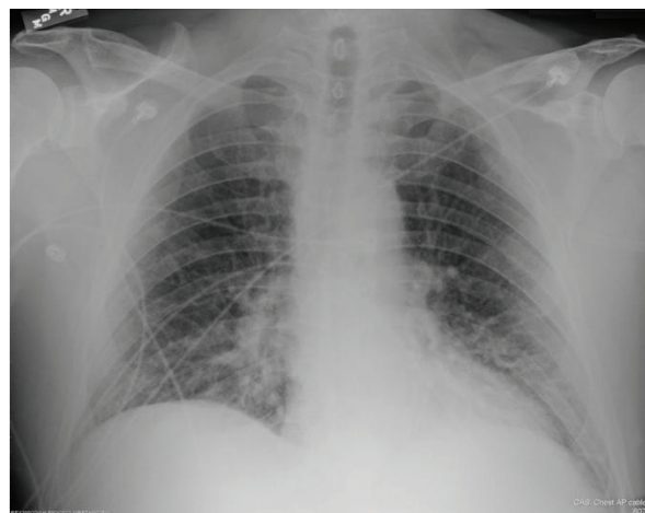
Figure 2. Chest radiograph at presentation.

The contribution of various infectious organisms to the burden of disease has changed over time. Gram negative bacilli were the predominant organisms associated with nosocomial bacteremia in the US prior to the 1980s [16]. Gram positive aerobes now outnumber Gram negative organisms [11, 17], especially the emergence of methicillin resistant staphylococcus aureus . Although the percentage of gram negative bacillary bacteremia has decreased, these cause serious multidrug resistance problems increasing mortality rate [18], and is usually associated with at least one comorbid condition [19]. In 2003, gram-negative bacilli were respon-