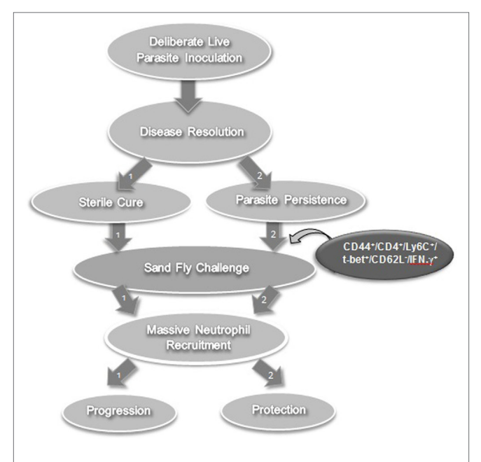
FIGURE 2 | Lessons learned from leishmanization in experimental models. Leishmanization (or deliberate parasite inoculation) fails to protect against sandfly challenge in the absence of persistent parasite (path number 1). However, if the parasite persists after healing, it gives rise to a T effector cell population that mediates effective protection against sandfly challenge (path number 2).

Dendritic cells are highly efficient APCs. They sense a large variety of signals in their environment, transport antigen