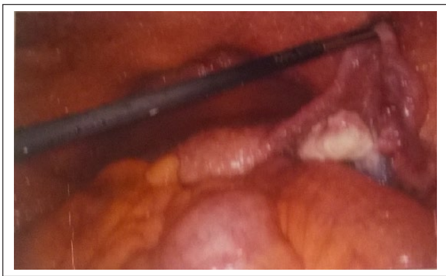
Figure 2. Whitish colored nodules found on peritoneum during laparoscopy.

B, and C panels, B-type natriuretic peptide, antinuclear antibody, kidney function tests, and thyroid function tests were within normal limits. Blood test revealed CA 125 antigen level 390.9 (normal = 0-38 U/mL) and rheumatoid factor level 41.6 IU/mL (normal = 0-13.9 IU/mL). Anti-cyclic citrullinated proteins test was not done. Purified protein derivative test was positive with 20 mm; however, 3 sets of sputum for acid-fast bacilli were negative.