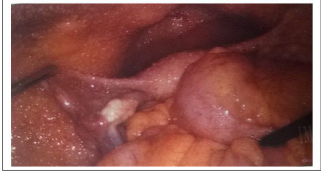
Figure 3. Whitish colored nodules found on peritoneum during laparoscopy.

The patient underwent peritoneal laparoscopy, which showed straw colored ascitic fluid with whitish tuberculous peritoneal nodules (Figures 1-3). Four liters of fluid was drained. Both ovaries were not enlarged and looked grossly normal. Biopsy of peritoneum revealed multiple nonnecrotizing and necrotizing granulomas with Langham type of giant cell and acid-fast bacilli