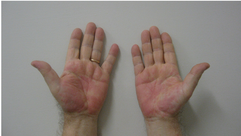
Figure 2 The lesions involved also the palmar aspect of both hands with edema and pain.

1 po after dinner, and \frac{1}{2} po 20 minutes before breakfast and lunch and 1 po 20 minutes before dinner. We also administered a hydrocortisone cream twice per day on the lesional skin. One week later, laboratory tests showed a reduced thrombocytopenia (platelets 126,000/\text{mm}^3 , with microscopic aggregates), moderate leukocytosis ( 12,100/\text{mm}^3 ), neutrophilia (83.6 %), anemia (hemoglobin HGB 11.2 g/dL), ESR 90 k/ \mu\text{L} . On the tenth day after his hospitalization there was a further improvement in hematological status: platelets (with microscopic aggregates) 131,000/\text{mm}^3 , with leukocytosis 14,430/\text{mm}^3 , neutrophilia (82%), anemia (hemoglobin 11.85 g/dL), ESR 95 k/ \mu\text{L} . On his last day of hospitalization platelets (with microscopic aggregates) were 271,000/\text{mm}^3 , white blood cells 9040/\text{mm}^3 , neutrophils (58%), hemoglobin HGB 13.2 g/dL.