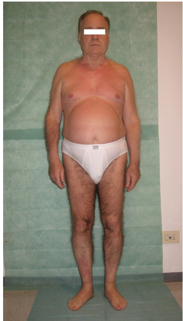
Figure 3 Clinical conditions of the patient after efalizumab suspension and platelet increase.

We have reported a case of efalizumab-associated thrombocytopenia in a psoriatic patient with diabetes as comorbidity. Efalizumab, in this patient, was chosen for