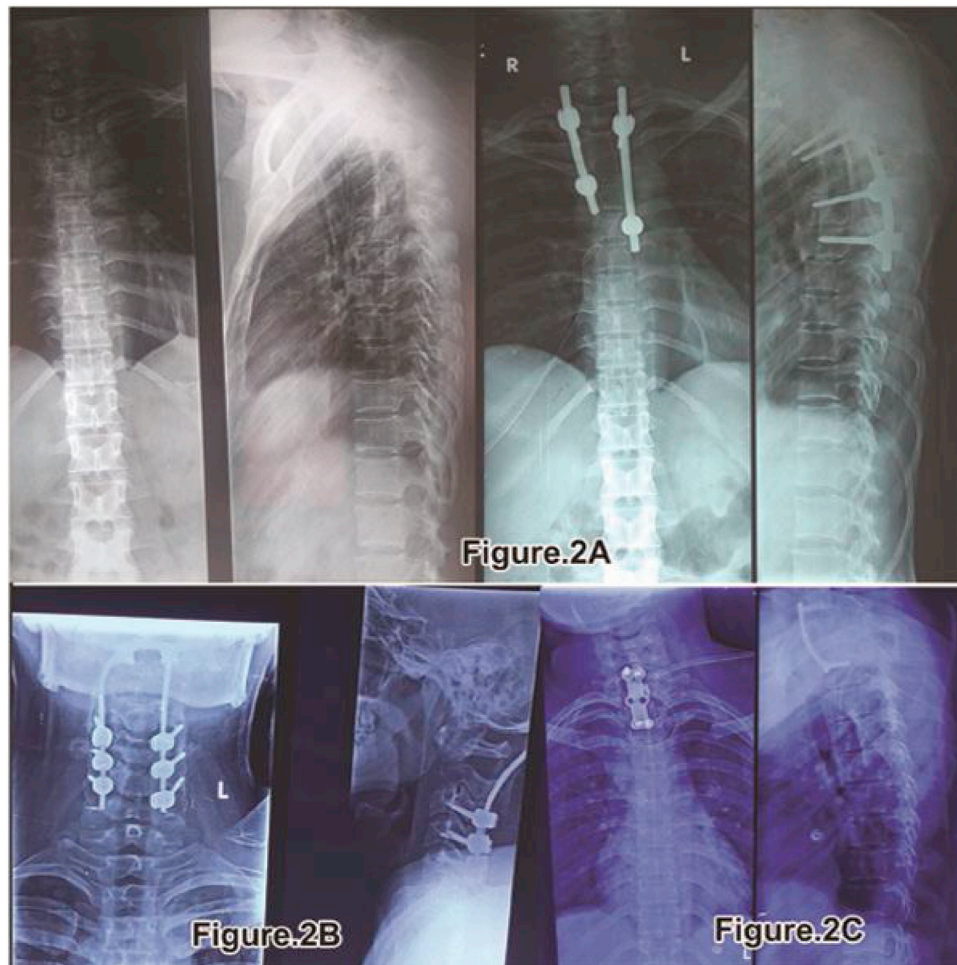
Fig. 2. Post-operative x-ray images showing the surgical intervention the patient underwent. A: Post-operative x-ray showing rib graft in situ and posterior fixation done after recurrence. B: Post-operative x-ray showing Lateral mass screw fixation at C2 level. C: Post-operative x-ray showing long cervical plate in situ after corpectomy C7-D1.

complete Pre-Anesthetic check-up and informed consent and excision biopsy was done using anterior approach. Excised material was sent for Histopathological examination. Patient was immobilized using crutch field tongs (CFT) till then. After 2 weeks, Report