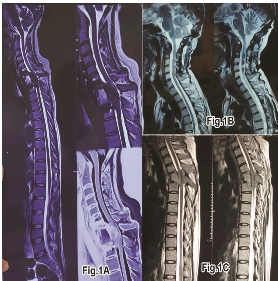
Fig. 1. Pre-operative MRI images sagittal section showing the location of GCT.

A: MRI images showing GCT at C7–D1 region.